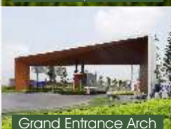
Grand Entrance Arch