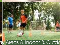
Play Areas & Indoor & Outdoor Sports