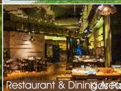
Restaurant & Dining Area