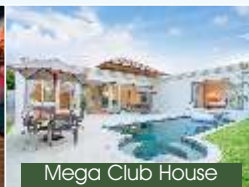
Mega Club House