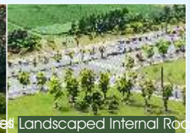
Landscaped Internal Roads