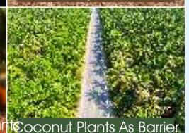
Coconut Plants As Barrier