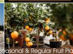
Seasonal & Regular Fruit Plants