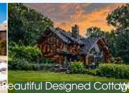
Beautiful Designed Cottages