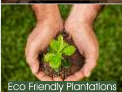
Eco Friendly Plantations