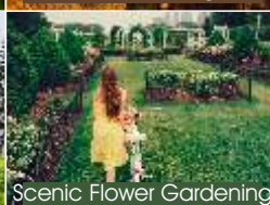
Scenic Flower Gardening